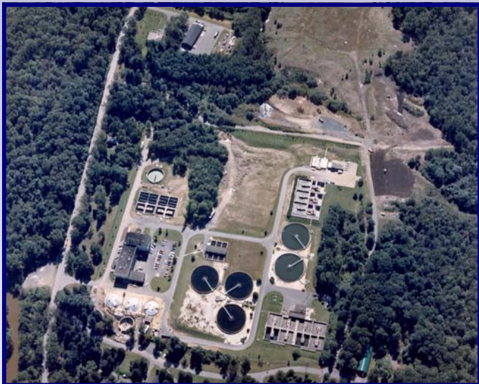
Stony Brook Regional Sewerage Authority (1989)