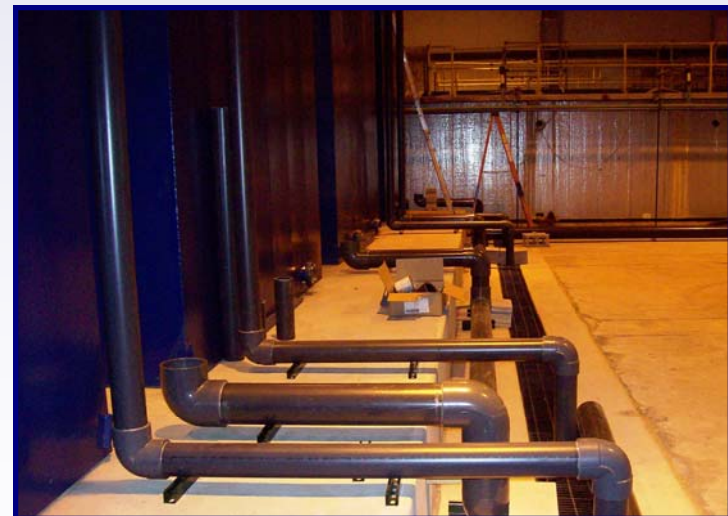
Delaware County Solid Waste Authority—Boyertown, PA (2011)