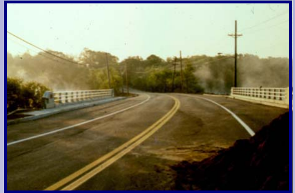
Bridge 3-K-4, Almonesson-Blenheim Road Gloucester County, NJ (1985)