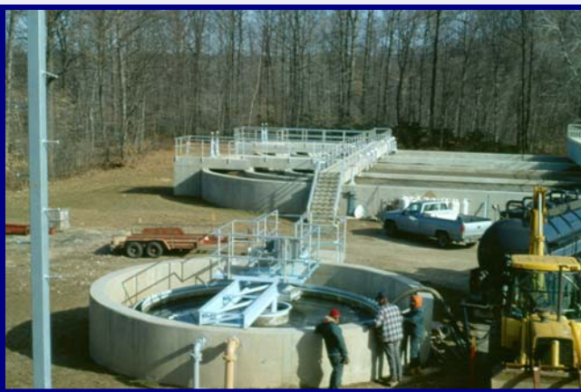
Township of Chatham WPCP (1992)