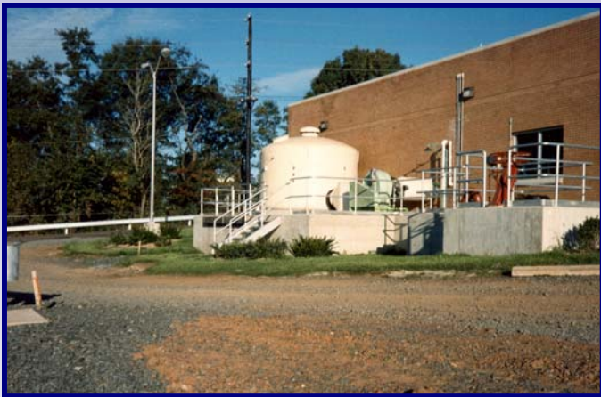
Somerset Raritan Valley Sewerage Authority Headworks Facility (1985)