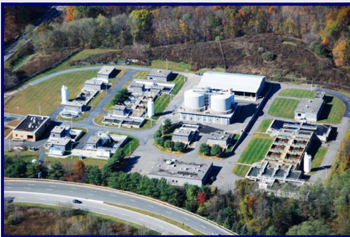
Musconetcong Sewerage Authority—Budd Lake, NJ (2005)