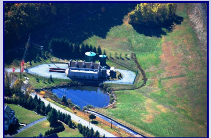
Clyde Potts Membrane Filtration Plant—Mendham, NJ (2004)