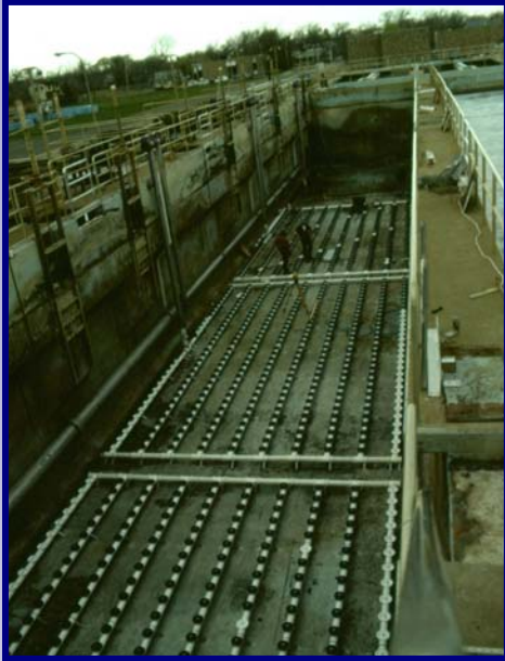
Somerset Raritan Valley Sewerage Authority (1993)