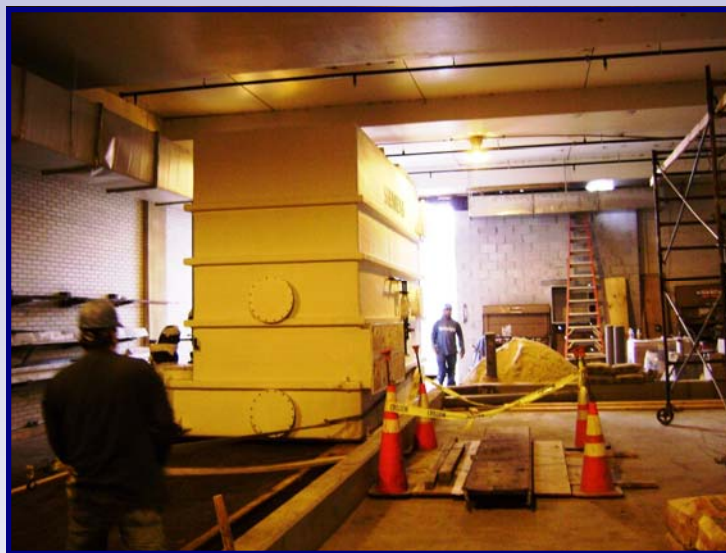
Asbury Park WWTP—Asbury Park, NJ (2009)

Congratulations!” - All the Folks at Harrington Industrial Plastics, LLC