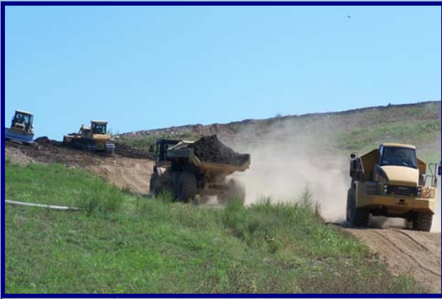
GROWS Landfill Reclamation—Morrisville, PA (2005)