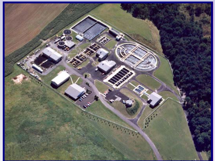
Chalfont-New Britain Township Joint Sewerage Authority (1989)