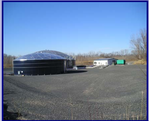
GROWS Landfill—Morrisville, PA (2006)