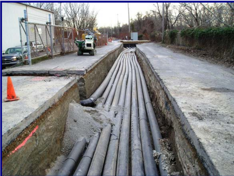
G.R.O.W.S. Force Main & Pump Station Design Build— Morrisville, PA (2010)