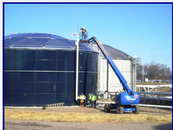
Tank #5 Tullytown Resource Recovery Center— Bucks County, PA (2009)