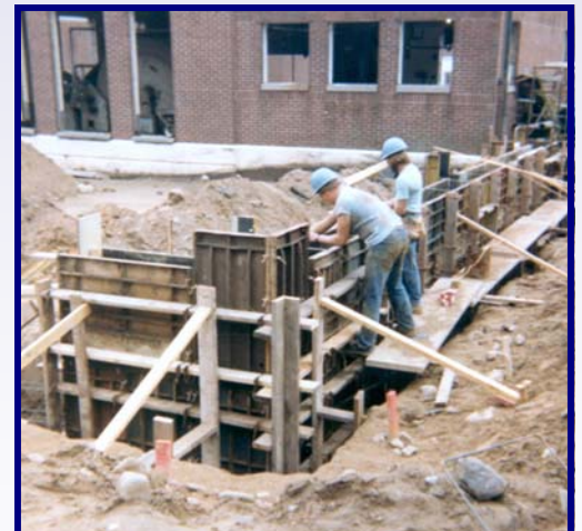
Lower Bucks Jt. Municipal Authority (1984)