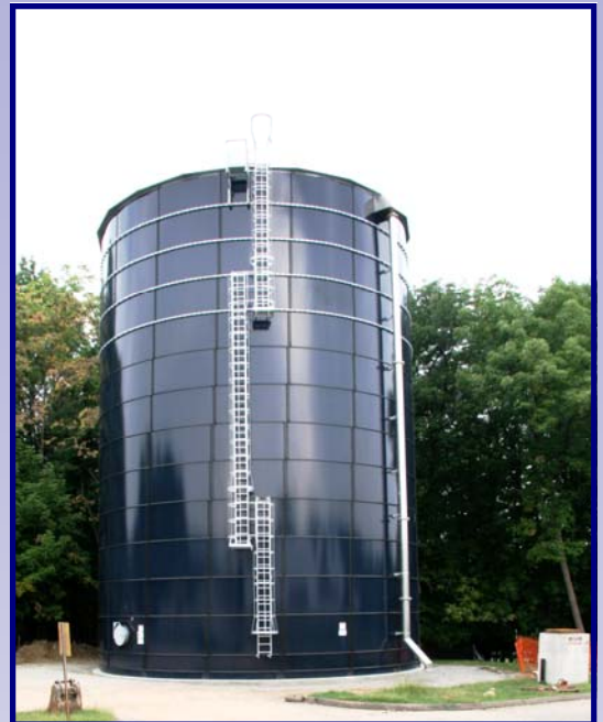
Jersey City MUA—Jersey City, NJ (2010)