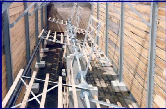
Elizabethtown Water Company, Raritan Mill Stone Plant (1986)