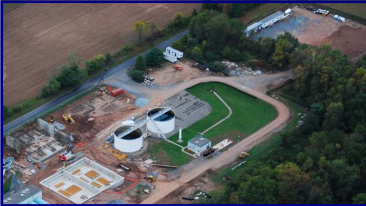
North Brunswick WTP Upgrade—North Brunswick, NJ (2010)