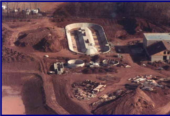
Aerial view of Readington Lebanon WWTP (1982)