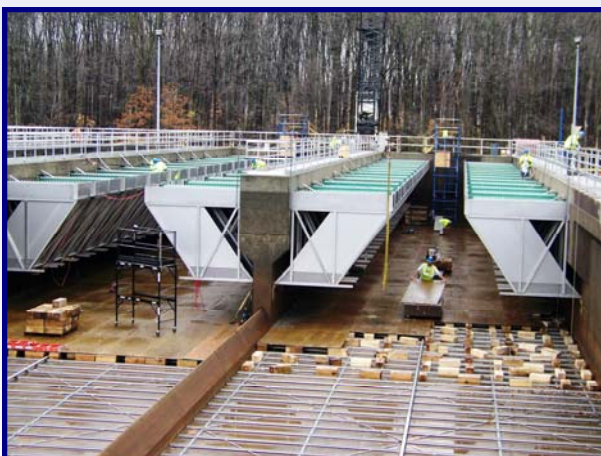
Jersey City MUA—Jersey City, NJ (2009)