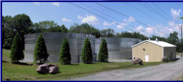
PA American Water—Pocono Country Place WWTP (2002)