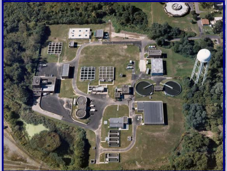
Municipal Authority of the Borough of Morrisville, PA (1989)