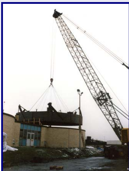
Bristol Township Sewage Plant (1986)