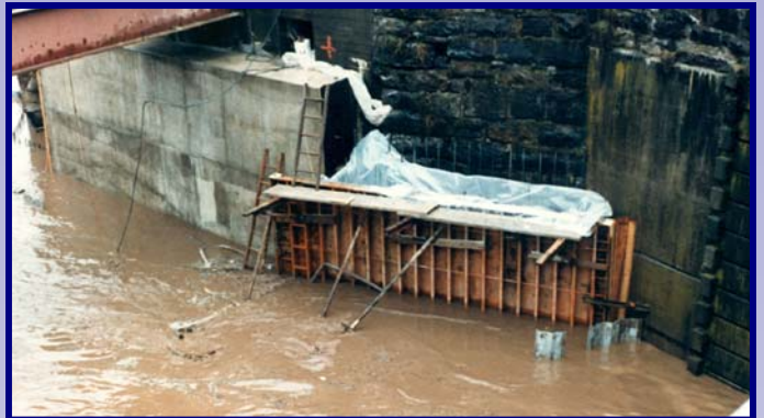
Durham Lock—Delaware Canal (1983)