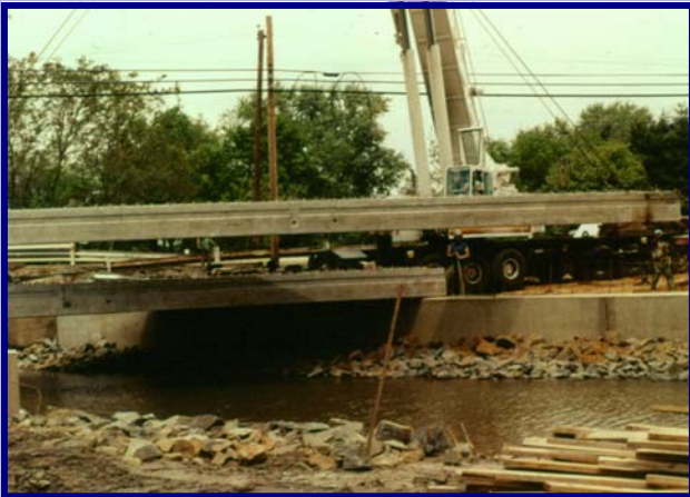
Bridge H-2 on County Route 620—Monmouth County, NJ (1984)