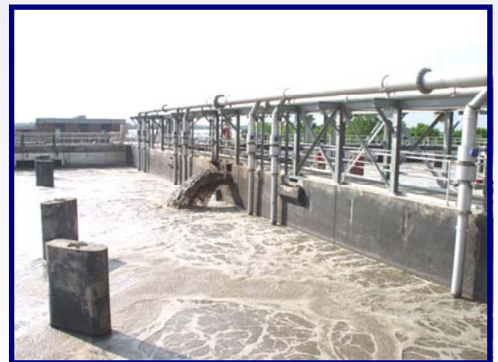
DELCORA—Chester, PA (2005)