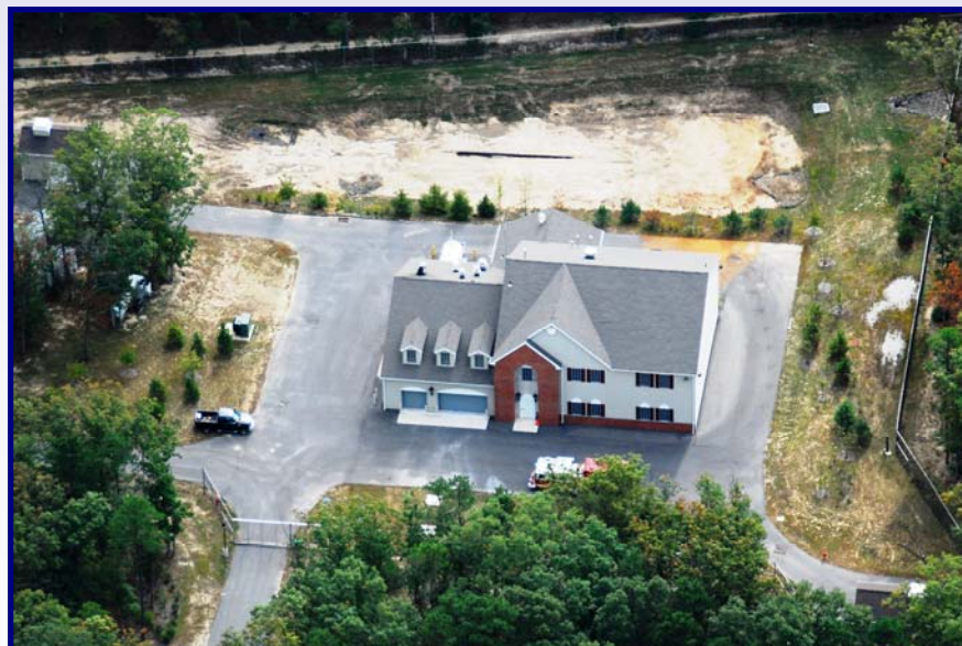
Ocean Acres WTP—Stafford Township, NJ (2006)