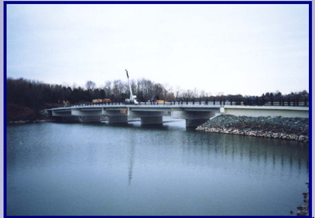
Knight Road Bridge and Trail over Green Lane Reservoir (1999)