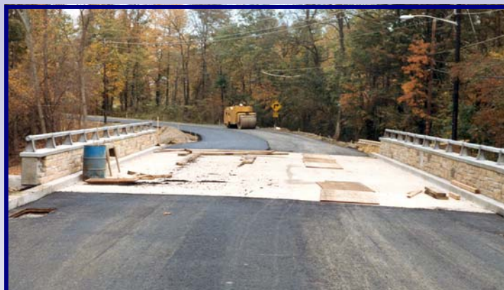
Bridge D4.50 -Burlington County, NJ (1984)