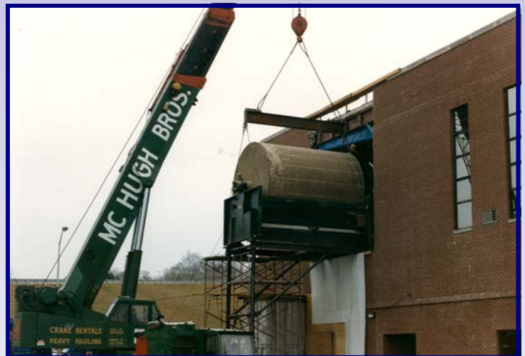
Hamilton Township Pollution Control Facility (1986)