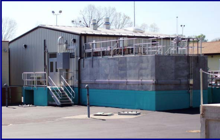
Upper Moreland Hatboro Joint Sewer Authority— Willow Grove, PA (2007)