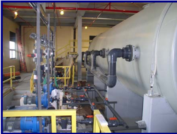
Belmont WWTP—Philadelphia, PA (2006)

“Congratulations to Stone Hill on your wonderful accomplishment. We wish you much continued success. Happy 30 th Anniversary!.” --- Your Friends at Travelers